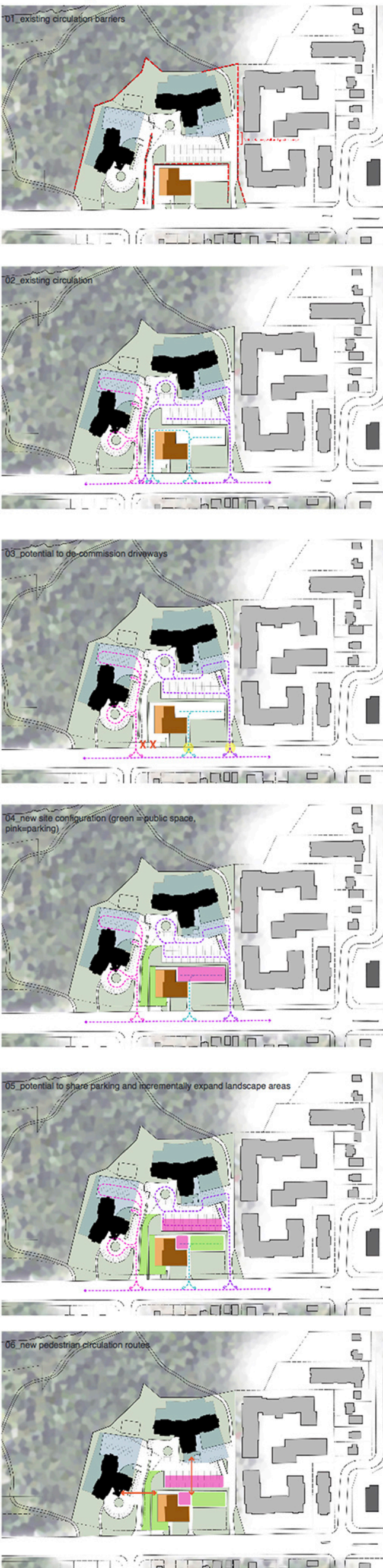
An incremental approach